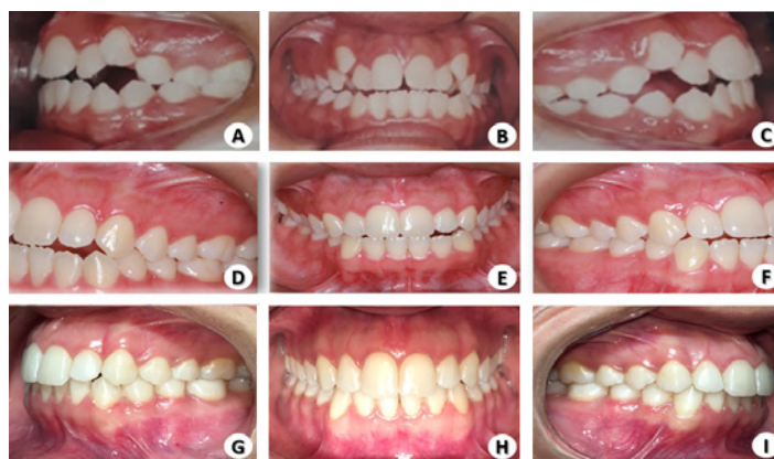
Figure 2. A, B and C - Initial intraoral photographs of the first treatment. D, E and F - Initial intraoral photographs before to retreatment. G, H and I - Intraoral photographs 06 months after retreatment.