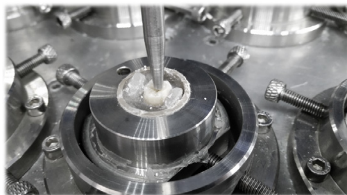
Figure 1. Specimen in position on the cyler ready for the start of the test

The specimens were carried to the thermo-mechanical cyler Erios ER- 37000NG (Erios, São Paulo, SP, Brazil), with a previously stipulated force and cycles (Figure 1). The active point of the cyler was put in position in contact to the chosen GIC restoration region (2mm inboard from the point of contact with the neighbor) and the machine was configured to do only axial force without sliding, with 50Kgf and 100,000 cycles (18 hours 37 minutes 5 seconds), at a frequency of 2 Hz. This protocol was based on previous studies. 18 It was necessary to do a total of 3 cycles, with 10 specimens per test, obtaining a total of 30 specimens.