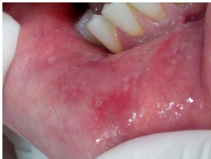
Figure 4. Case 4 – Reddish plaque and vesicles on the lower labial mucosa

Case 4 – A 56-year-old female was referred for evaluation of several painful reddish plaques, vesicles, and aphthae-like lesions on her lower labial mucosa lasting 7 days (Figure 4). Medical history revealed controlled arterial hypertension. The patient reported starting the use of a different toothpaste 3 weeks before the onset of the lesions. Clinical provisional diagnosis included contact stomatitis to toothpaste, aphthous ulcers, erosive lichen planus, mucous membrane pemphigoid, and pemphigus vulgaris. Interruption of the use of the toothpaste resulted in remission of the lesions in 7 days.