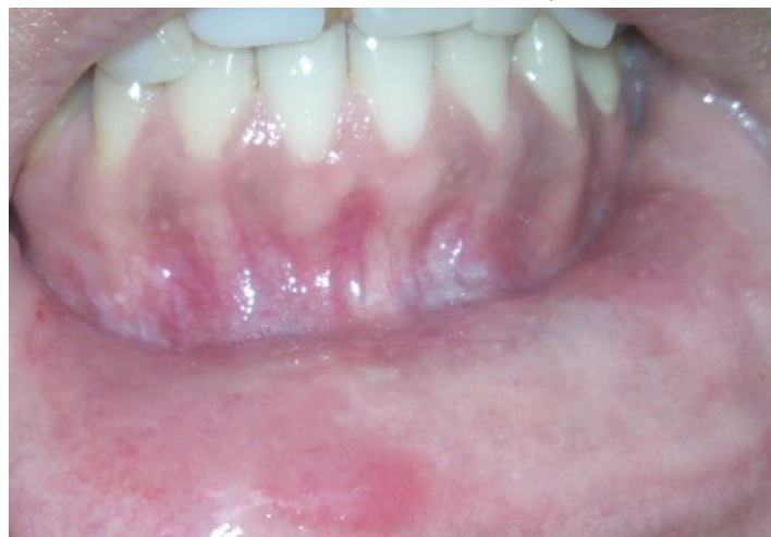
Figure 3. Case 3 – Reddish plaques on the lower labial mucosa

Case 3 – A 22-year-old female was referred for evaluation of moderate painful reddish plaques on her lower labial mucosa lasting 2 days (Figure 3). The patient reported that burning sensation and red lesions have appeared after she started the use of a different toothpaste. Her medical history was non contributory. Clinical provisional diagnosis was contact stomatitis to toothpaste and interruption of its use resulted in remission of the lesions in 5 days.