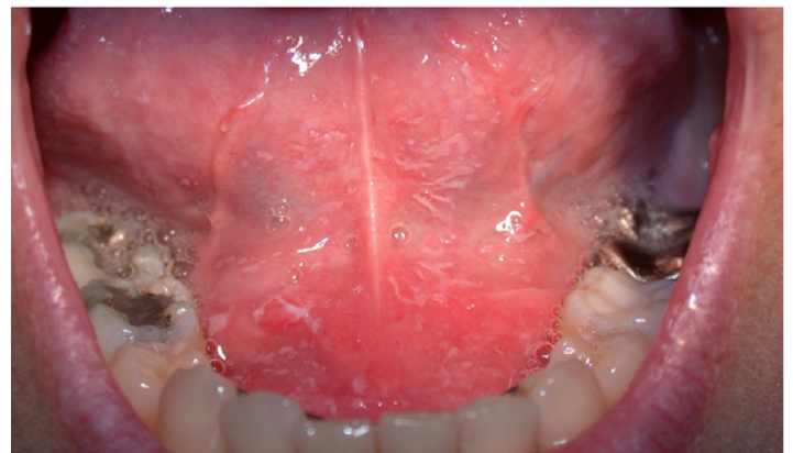
Figure 1. Case 1. Whitish desquamative plaques on the floor of mouth

Case 1 - A 48-year-old female was referred for consultation presenting several painful and burning whitish desquamative plaques on the floor of the mouth lasting 15 days (Figure 1). Medical history was non contributory. Patient reported that she had started the use of a different toothpaste just before the onset of the lesions. Clinical provisional diagnosis included contact stomatitis to toothpaste, oral burn, pseudomembranous candidosis and leukoplakia. The patient was oriented to stop the use of the toothpaste and the lesions disappeared in 5 days, confirming the diagnosis of contact stomatitis. The patient remains in clinical follow-up for 24 months with no signs of recurrence.