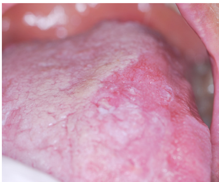
Figure 4. Clinical diagnosis of candidiasis and without cytopathological diagnosis of candidiasis (CC CyNC). Erythematous area on the tongue showed clinical changes indicative of candidiasis but with features compatible with squamous cell carcinoma on cytopathological exam.