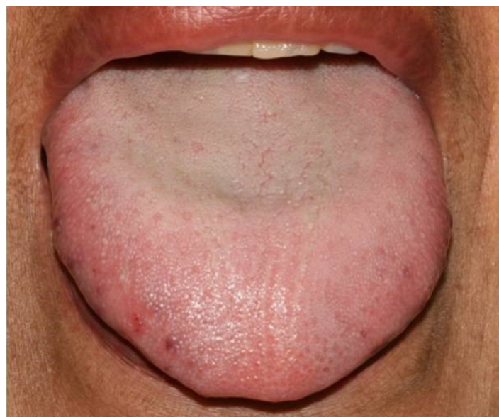
Figure 6. Without any clinical signs of candidiasis but with a cytopathological diagnosis of candidiasis (WCC CyC). Tongue without clinical changes indicative of candidiasis but cytopathological exam positive for candidiasis.