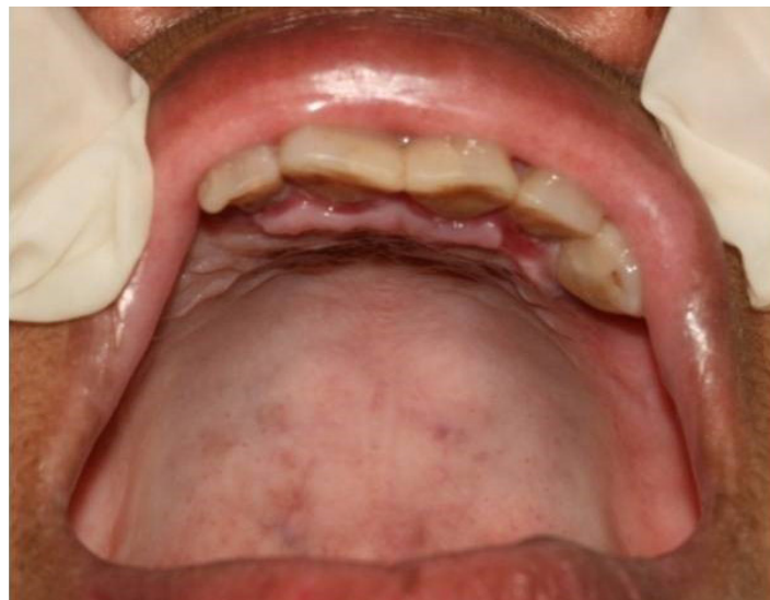
Figure 5. Without any clinical signs of candidiasis but with a cytopathological diagnosis of candidiasis (WCC CyC). Palate without clinical changes indicative of candidiasis but cytopathological exam positive for candidiasis.