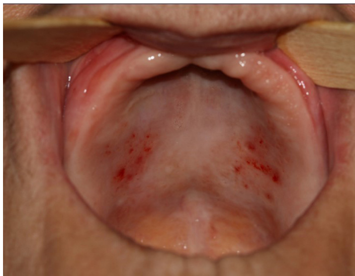
Figure 3. Clinical diagnosis of candidiasis and without cytopathological diagnosis of candidiasis (CC CyNC). Erythematous lesion on palate showed clinical changes indicative of candidiasis but did not show any features compatible with the disease on cytopathological exam (Source: Oral Diagnosis Clinic, Hospital Universitário Antônio Pedro, Universidade Federal Fluminense).