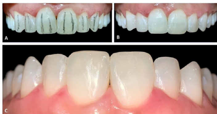
Figure 3. A. Reflection lines demarcated with graphite. B: Appearance after finishing. C: Final appearance after finishing and polishing.

After the removal of the rubber dam isolation, latero-protrusive movements were executed to adjust the contact points. The occlusal contacts were verified, using a strip of carbon (Accufilm II®). The initial dental finish was done in the same session with a scalpel blade number 15, fine-grained, ultra-fine finishing drills (KG Sorensen®), sandpaper strips and sandpaper discs (TDV) and, in subsequent consultation, a more refined finish was carried out. In the following session, the final finish and polish were done. The polyester sandpaper (TDV) was used in the proximal regions. The final finish was done mimicking the superficial texture, for this reason, a graphite point, areas of reflection of light were noticed (Figure 3A) and the finishing procedure with multi-laminated tips (Kerr Corporation) and fine-grained and ultra-fine diamonds (KG Sorensen®) (Figure 3B). The polishing was done using rubber polishers (TDV) and sandpaper discs for finishing and polishing (Superfix®, TDV) according to the sequence recommended by the manufacturer, finishing system Enhance (Dentsply®) and polishing paste Enamelize (Cosmedent) with Diamond felt disc (FMG®), obtaining a smooth and shiny final surface (Figure 3C). At the end of the treatment, an artistic photoshoot was come done with an Iphone X (Figure 4).