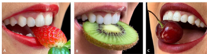
Figure 4. A, B, C: Artistic photos taken with Iphone X (iPhone - Apple (BR)) and natural light.