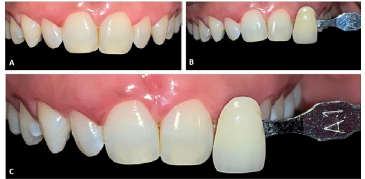
Figure 1. A: Anterior teeth before rehabilitative treatment. B: Selection of the initial shade A2. C: Final shade A1 after teeth bleaching treatment in the clinic (1 session) and at home (14 days).

case, intra-oral photographs were taken with an iPhone X (iPhone - Apple (BR)), initial dental impression with Alginate (Jeltrate ® , Dentsply) and the making of plaster dental cast (Herodent ® , Coltene). The diagnostic waxing from canine to canine was done with the intent to plan the form and final contour of the restoration.